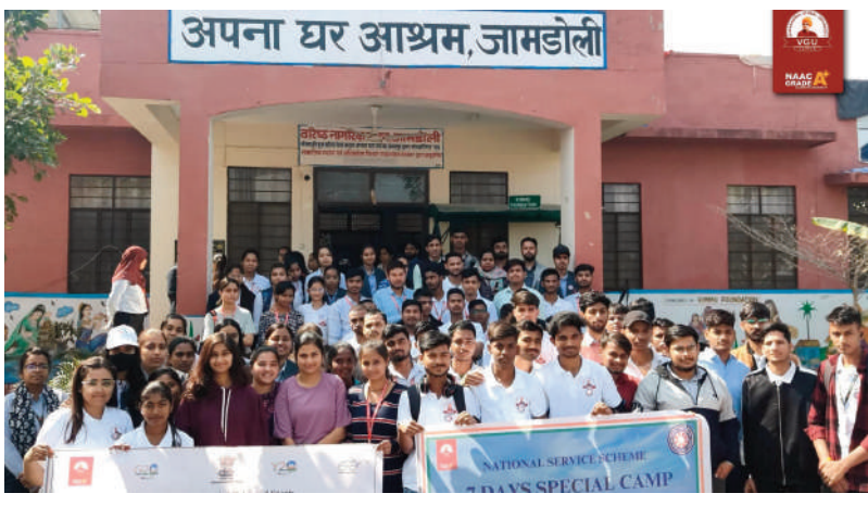
7 days, countless stories of impact. We cleaned, we connected, we cared. From 'Cleanliness Drive' to 'Apna Ghar Aashram' visit, culminating in a day of free Medical Checkups, our NSS journey radiates empowerment. Today, we close this chapter with gratitude and a commitment to making change happen.