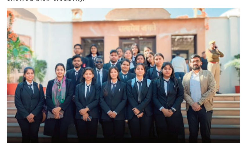
Exploring the realms of justice: VGU's Law students visited the High Court to immerse themselves in the intricacies of civil and criminal procedures during a visit to the Hon'ble Rajasthan High Court (Jaipur Bench) on February 8, 2024.