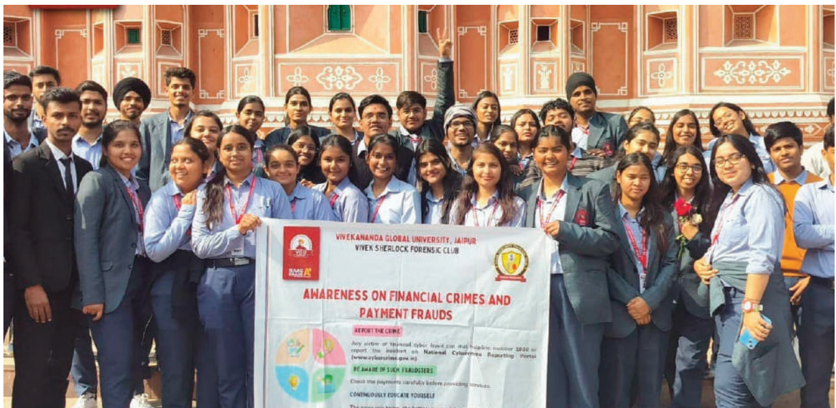
Fight against financial crimes: VGU students are campaigning to fight against financial crimes. Their survey on awareness is a step towards a safer, more informed community.

If we unite, we have the potential to create a network that spans the entire country and various professions. Your active participation will contribute to the continued success and growth of our alma mater.".He further highlighted, "Today, we have 16,700 alumni in the VGU Alumni Association.